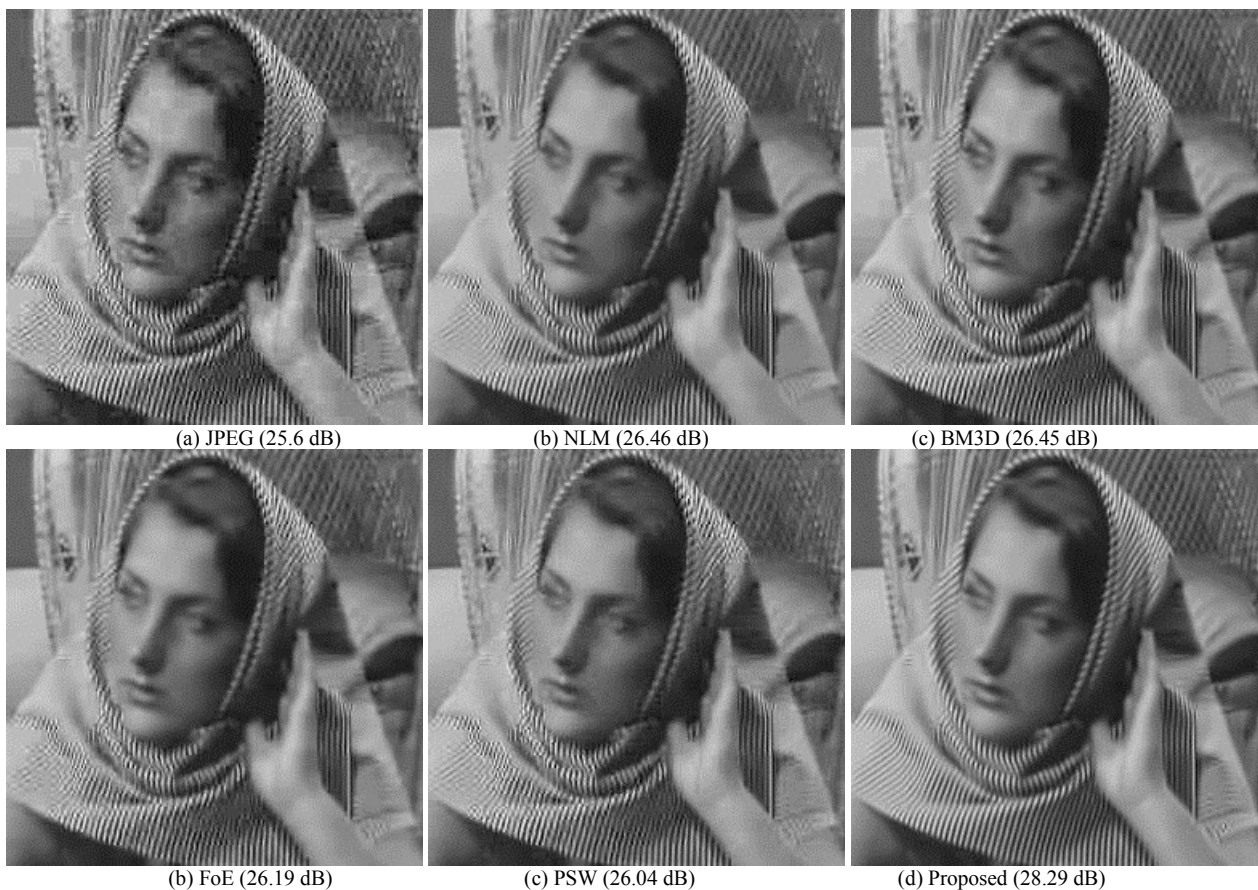
Fig. 3. Image visual quality comparison of different restoration methods for Barbara at QF=10.